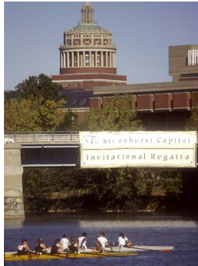
The regatta is a fixture on Meliora Weekend.