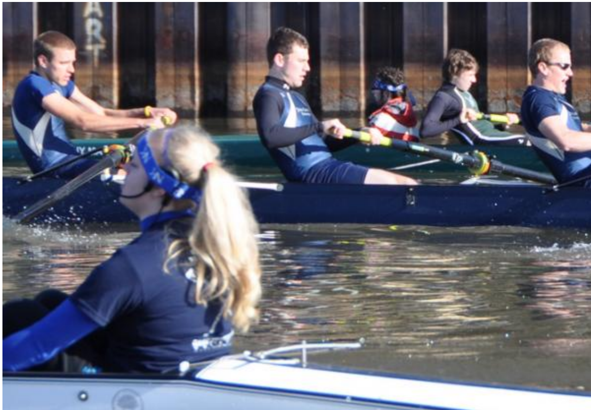
Cleveland Collegiate Regatta Mens Four Race